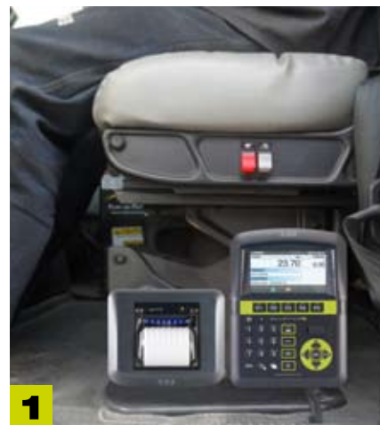
1 Onboard instrumentation millennium5