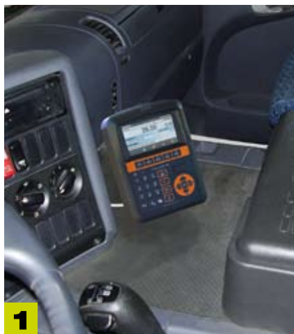
1 Onboard instrumentation helperX