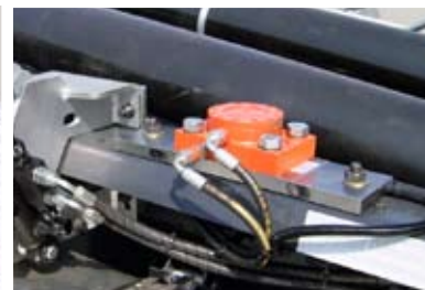
weighing pads bolted on the frame