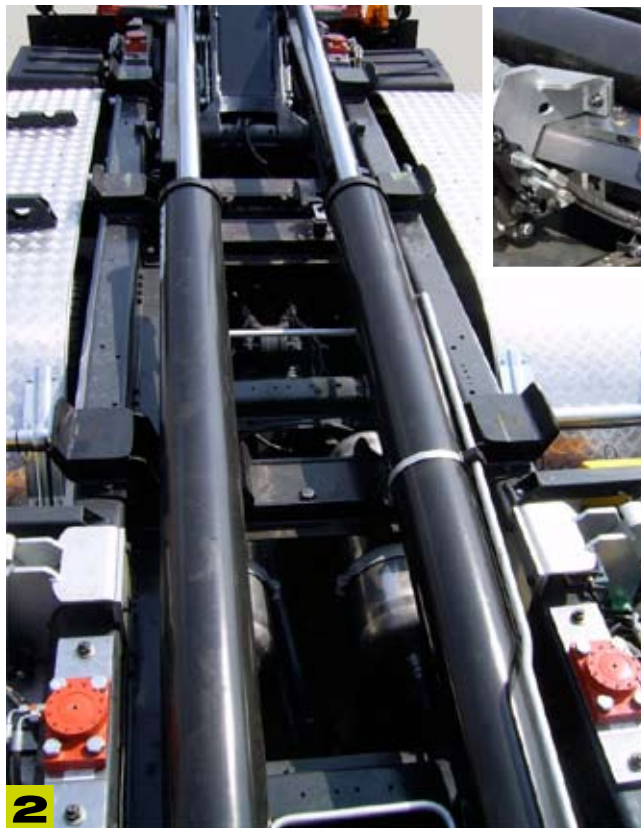
2 Weighing pads group on the truck's chassis