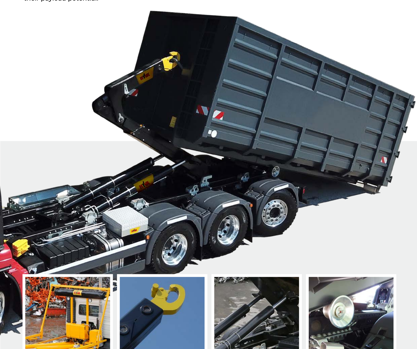
Full specification includes Autosheet

Hyva's range of hookloaders covers everything from lightweight 3.5 tonnes van chassis cabs right through to 32 tonnes gvw eight wheelers. As with all Hyva equipment, our hookloaders are strong, robust, durable and inherently safe to use. Of advanced design and built with premium specification materials, Hyva hookloaders also maximise their payload potential.